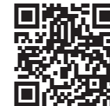
See our products online