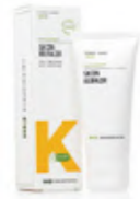
SKIN REPAIR Therapeutic cream to restore damaged skin.