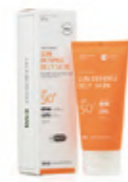
SUN DEFENSE OILY SKIN SPF 50+ Broad-spectrum sunscreen with sebum- regulating properties.