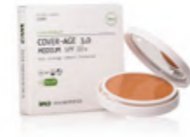
COVER-AGE 3.0 SPF50+ sunscreen and full coverage foundation.