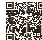
Download our catalog