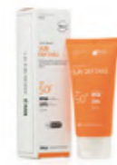
SUN DEFENSE SPF 50+ Lightweight and water resistant sunscreen with moisturizing and antioxidant properties.